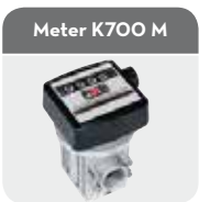
Meter K700 M

Flow rate: 20 -220 l/min Accuracy: +/- 1% Oval gear system Code: FO0540000