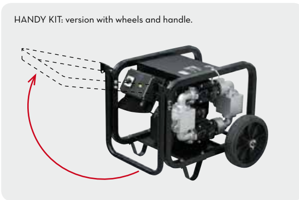
HANDY KIT: version with wheels and handle.