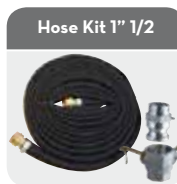
Hose Kit 1" 1/2

Fow rate 280 l/min with swivel Code: F13249000